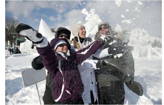
International Program 2019/20